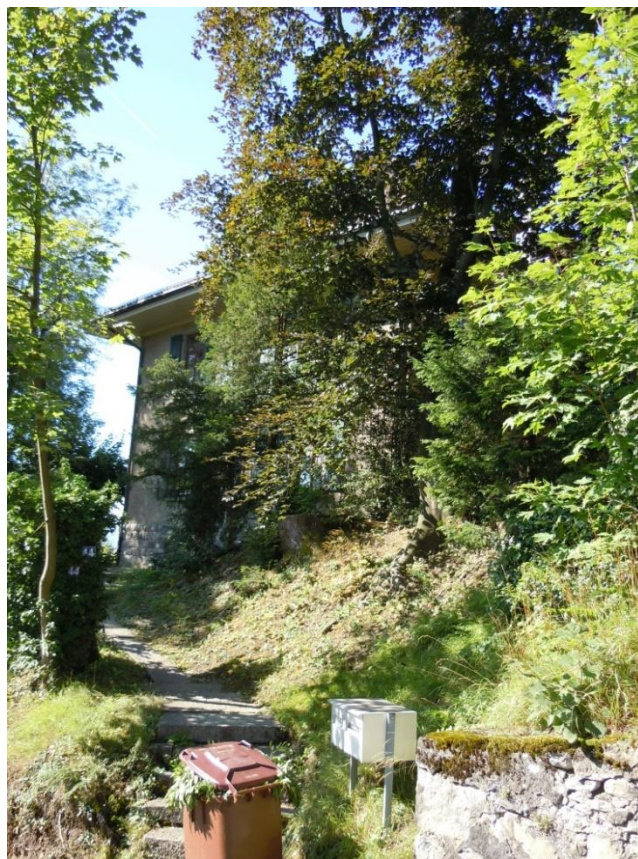
Access from the East