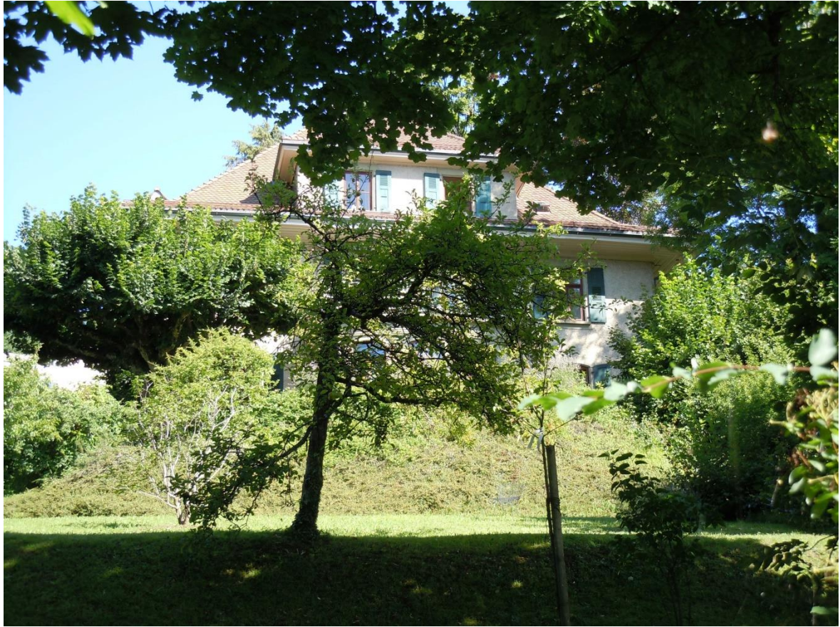
Facade to the Lake of Geneva (South)