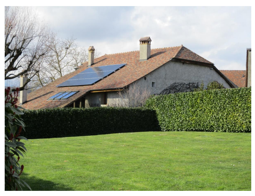
Seen from the south-east