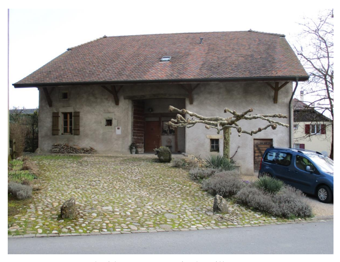
North side – entrance via the village street