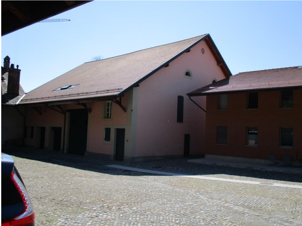
Interior of the court – north facade of the housing