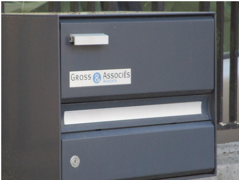
The letter box of the Lawyers office, at the Avenue des Mousquines 20, 1001 Lausanne