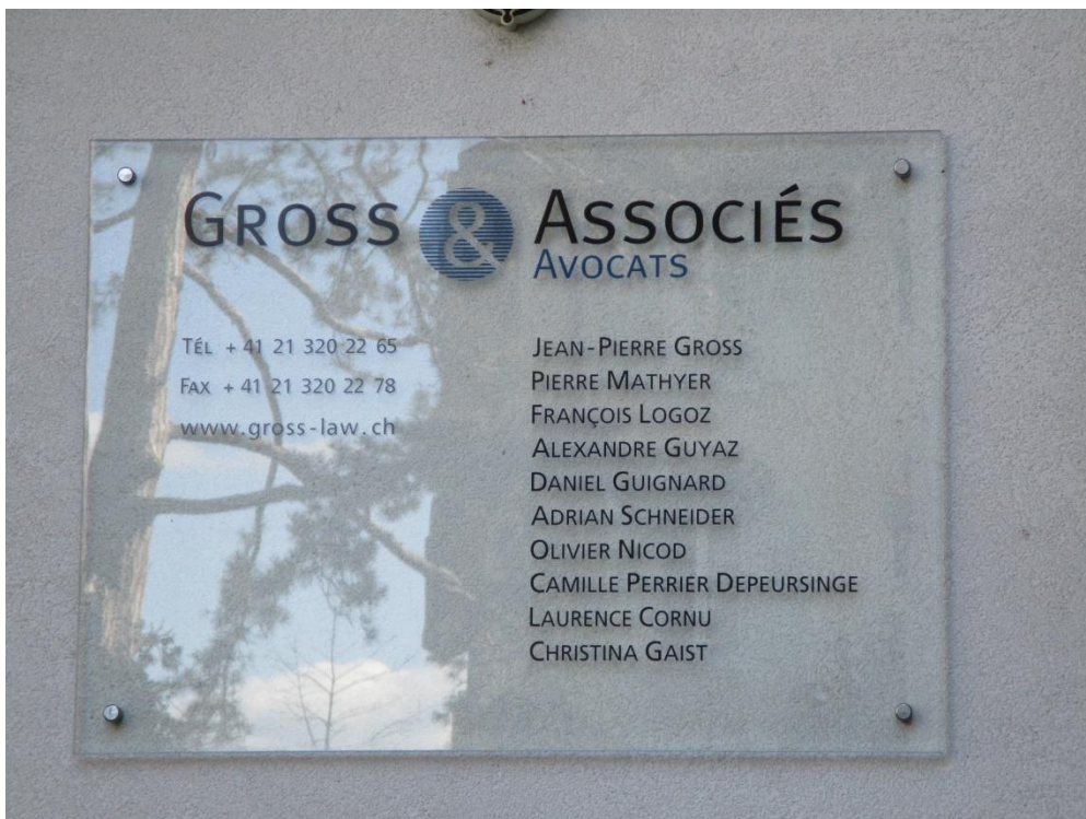
The Poster of the Office with the list of the partners