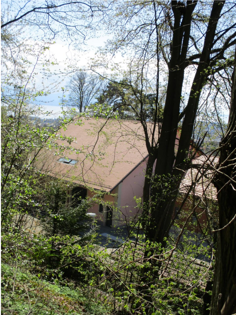
View of the opulent private residence of GROSS photographed from the northern hillside, in direction of Lake Geneva