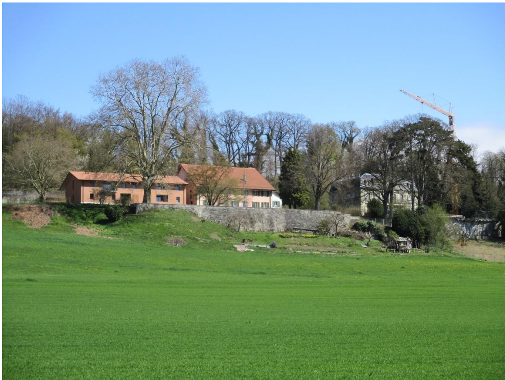
View of the residence from south