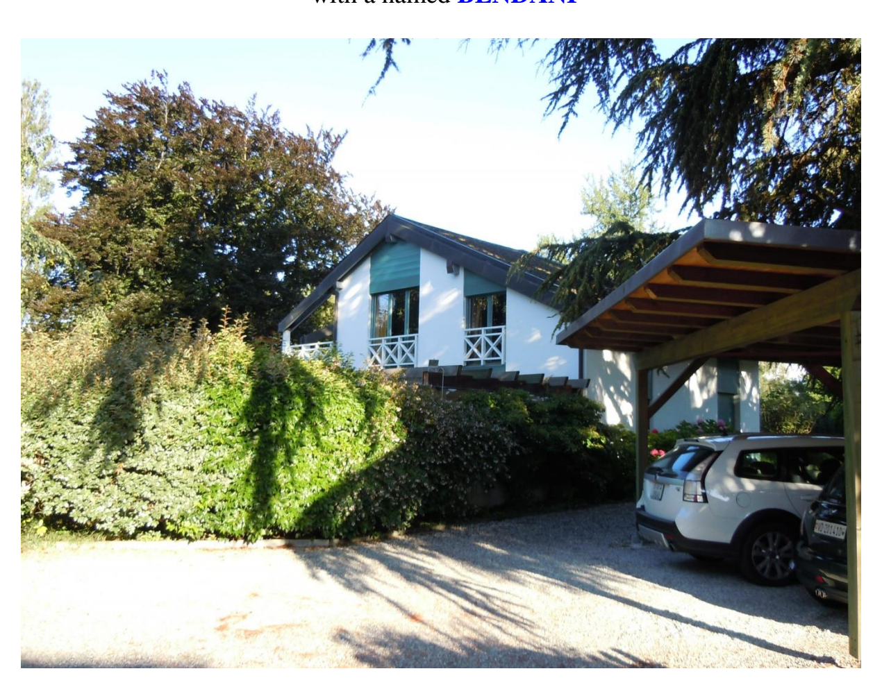
The luxury villa of COLELOUGH, access from the east