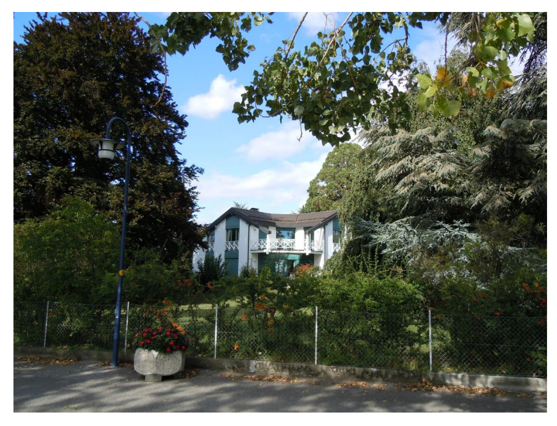
COLELOUGH's villa seen from the south, from the side of the chemin du Lac