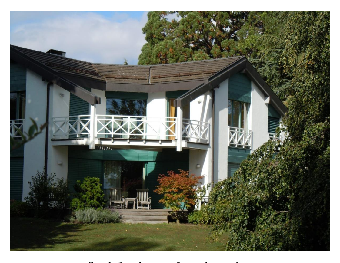
South facade, seen from closer view