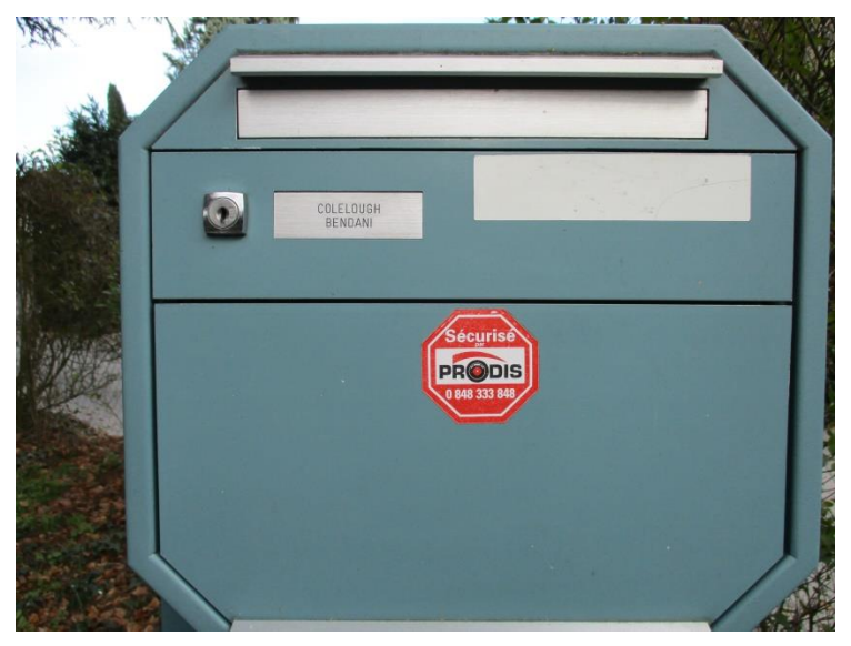
The inscription on the mailbox indicates that COLELOUGH cohabits