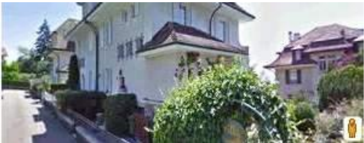
Street view of the house of AEMISEGGER