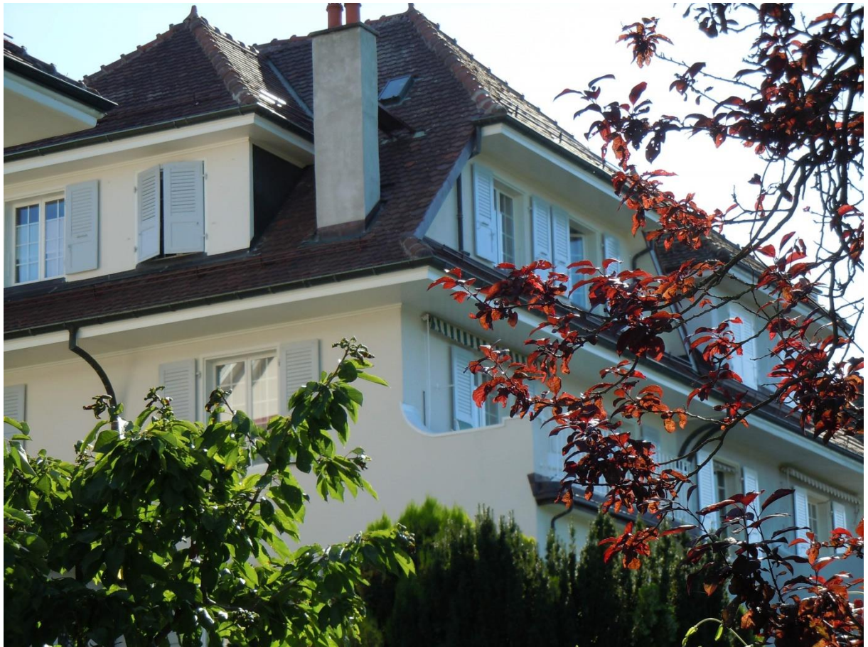
The upper floors of the house of AEMISEGGER