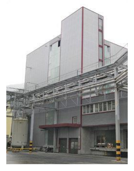
Griltex grinding plant.

In order to satisfy increasing demand for fusible adhesive powder Griltex® for coating interlinings and in order to further safeguard EMS' position as market leader worldwide, a new cold grinding plant is opened in Domat/Ems.