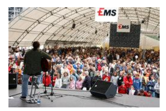
Open Day - Saturday, June 2, 2007

On May 25, 2007 construction of the EMS-PATVAG production plant in Brankovice (Czech Republic) started. Airbag igniters for the automotive industry will be manufactured here starting in early 2008.